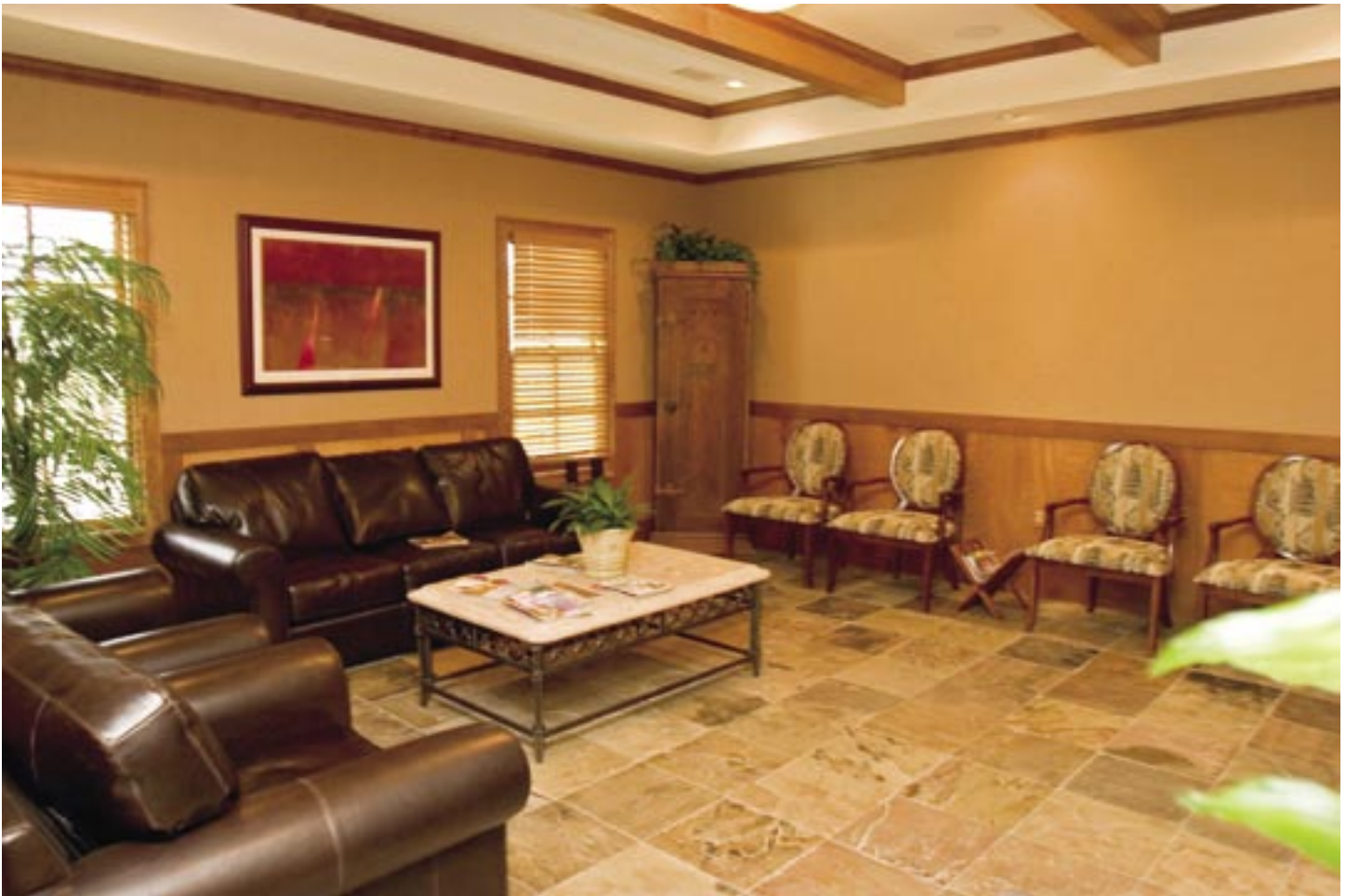
Each cottage at the Cowles Clinic medical campus has been designed with comfort, convenience and privacy in mind. Amenities include warm “lodge” ambience with comfortable waiting rooms.

Other specialties identified for the Cowles Clinic medical campus include dermatology, gastroenterology, neurosurgery, neurology, pain management, plastic surgery, vascular surgery, otolaryngology, gynecology, endocrinology, ophthalmology, pulmonology, ENT, sleep wellness and pediatrics. After the need for physicians’ full-time presence is demonstrated, that doctor will make a full-time commitment to the Cowles Clinic and Lake Oconee residents.