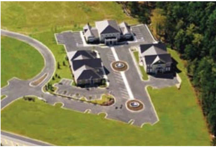
With all practices located in cottages on the same property, patients can easily walk or drive to each building, reducing stress and anxiety levels.